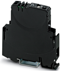
Electronic circuit breaker, 1 reset input, nominal current: 8 A

Please be informed that the data shown in this PDF Document is generated from our Online Catalog. Please find the complete data in the user's documentation. Our General Terms of Use for Downloads are valid ( http://phoenixcontact.com/download )